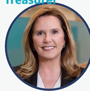
Vice President, Chief Compliance Officer Incyte