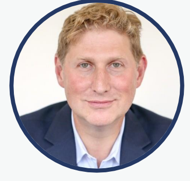
Global Head of Ethics & Compliance Program and Governance Takeda