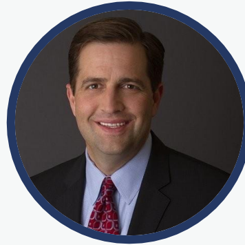
Senior Vice President, Chief Compliance Officer SpringWorks Therapeutics