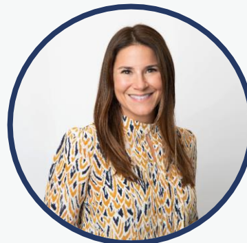
Chief Compliance & Risk Officer EQRx